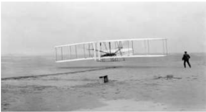
Wilbur and Orville Wright first successful Airplane on December 17, 1903