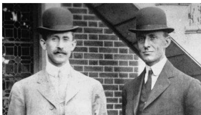
Wilbur and Orville Wright (Wright Brothers)

But when they experimented with Gliders, it was thought that A little can happen, but if they would fail in their experiment, then human desire to fly would remain incomplete, but later they showed that the plane that was flying even today, it reminds us of the Wright Brothers and also assures that if a person wants to do something, he can reach to any desired destination.