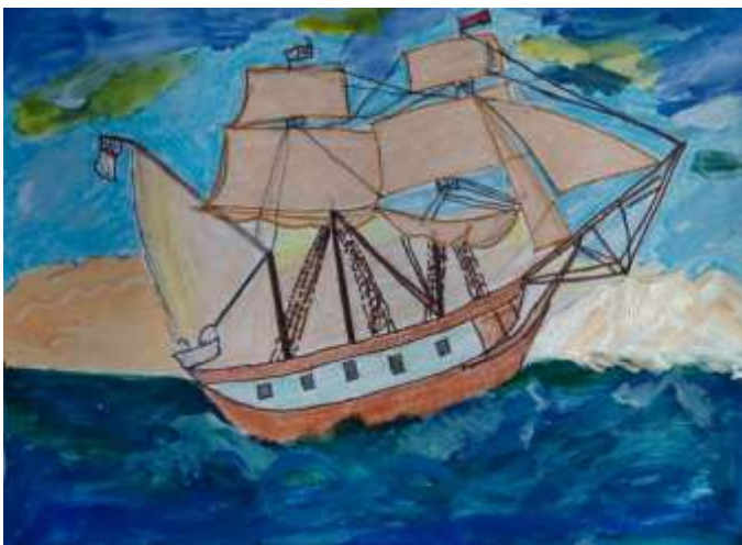
'HMS Beagle ship' of Charles Robert Darwin

Charles Robert Darwin, who gave this concept for Theory of Natural Selection or Origin of life. To understand this concept he attempted to go to nature and for which he travelled by a ship called HMS Beagle, For real time experience to understand the nature. To understand something it is needed to be closer, that is why Charles Darwin made this kind of journey to understand Nature after which he gave the concept for Theory of Natural Selection. Though, He was not a Certified Research Scholar, Scientist, or PhD Scholar, but the study of the concept he had given to us till today shows how big it was to be a strong man, Generally people study something and keep it. But those were the people who lived the study with their life .Lets take the example of Gregor Mendel, he was an Administrator of a Religious Institution, but his interest was in Research, so what he had given us "The Law of the genetics", which had changed later, but on the basis of it is that even today, whenever it comes to the Genetics or Hereditary, the principal of Gregor Mendel will definitely be there. It tells us that if a person has a passion to do something, Nature also helps him and he can reach his Destination.